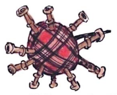
SCOTTISH VARIANT At least you can hear it coming

2019: Avoid negative people 2020: Avoid positive people 2021: Avoid people, because you don't know if they are positive or negative.